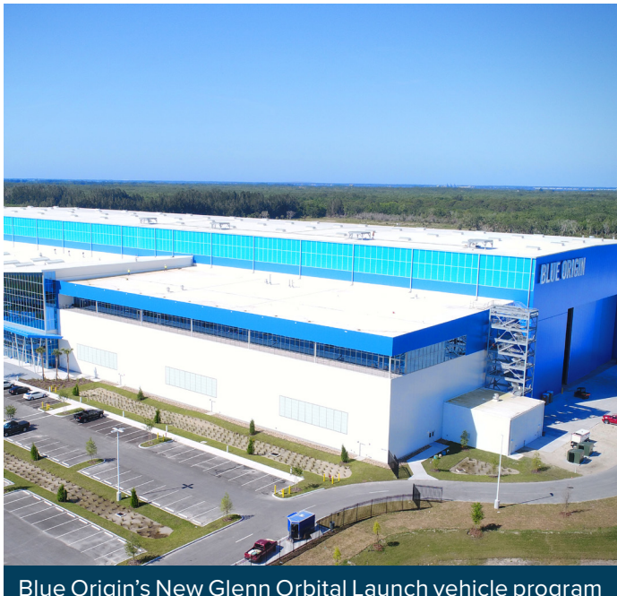
Blue Origin's New Glenn Orbital Launch vehicle program launch, manufacturing and support facility in Florida.

Space Florida's business development opportunities continue to grow the state's commercial space industry and other aerospace-related sectors through various innovation accelerators, financing capabilities and spaceport improvement program activities.