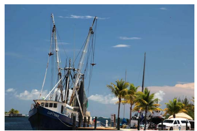
Stock Island Marina

Access to and from the Keys is primarily by U.S. Highway 1. Evacuation of the Keys' population in advance of a hurricane strike is essential for public safety. No hurricane shelters are available in the Florida Keys for Category 3-5 hurricane storm events. A system of managed growth was developed to ensure the ability to evacuate within the 24-hour evacuation clearance time as required by section 380.0552(9)(a)2., Florida Statutes. To meet a 24hour evacuation clearance time, a phased hurricane evacuation procedure has been developed. The evacuation procedure is separated into two phases: