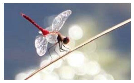
Scarlet Skimmer Dragonfly

amendments have been challenged in each jurisdiction. The three cases were combined and a hearing with the Division of Administrative Hearings is scheduled for December 2019.