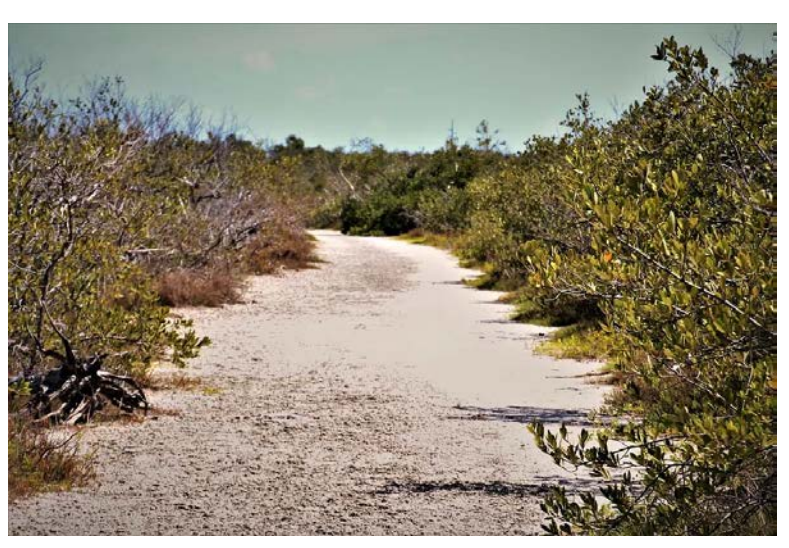
National Key Deer Refuge, Big Pine Key

This narrative provides an overview of this year's rule requirements and should be used in conjunction with the Florida Administration Commission's Matrix at Tab 3 to expedite review. The Matrix is the Florida Administration Commission Rule in a different format. It contains the status of each Work Program task in the third column as either "complete" or "incomplete" and the tasks due during this reporting period are highlighted in vellow. The Matrix includes comments and information submitted by the local governments.