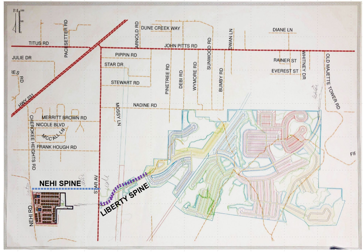
Figure 2: Panama City North, with Proposed Spine Road Projects