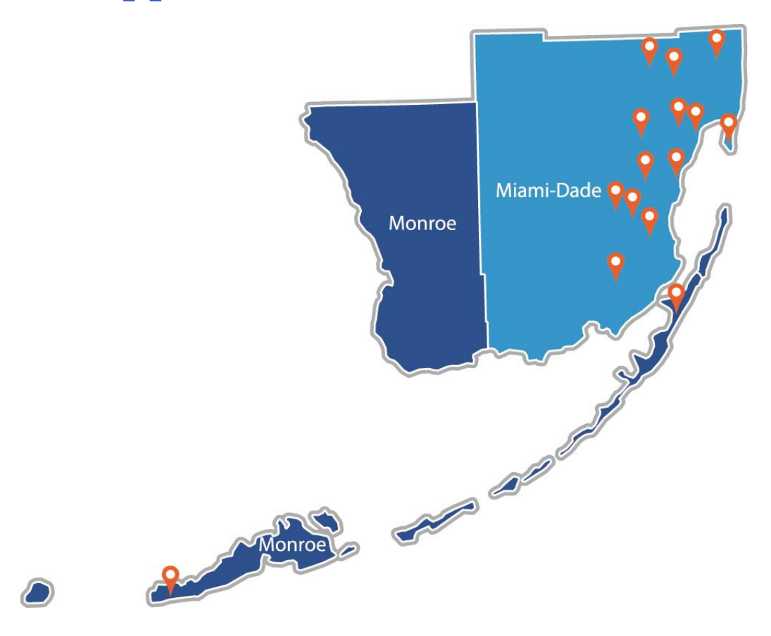
Exhibit_B_CSSF Service Locations

B. Identify the days and times when service delivery offices are open to customers. Customers must have access to programs, services and activities during regular business days at a comprehensive one-stop center.