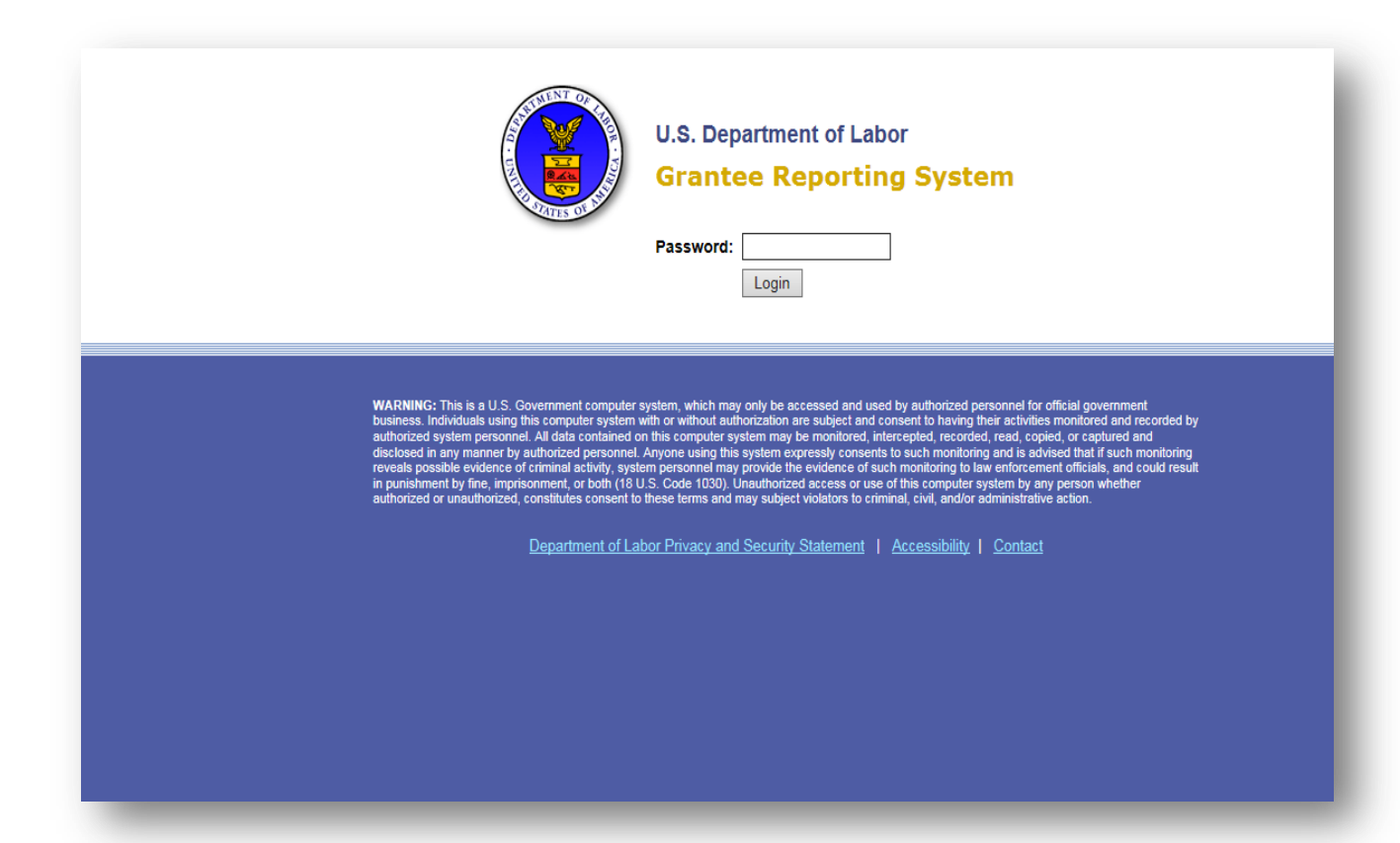
Figure 3: Sample Reporting System Webpage