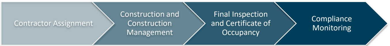
Figure 2: Construction and Compliance

The construction and compliance phase, as seen in Figure 2, is where repair, replacement or reconstruction assistance is provided to the property owner through direct construction activities performed by the program and the result is a rehabilitated housing unit. After final construction activities and the completion of any compliance period, the grant will be closed out.