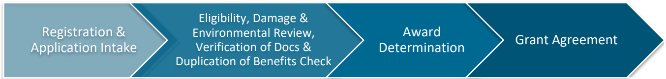
Figure 1: Initial Application and Documentation Steps

The construction and compliance phase, as seen in Figure 2, is where repair, replacement or reconstruction assistance is provided to the property owner through direct construction activities performed by the program and the result is a rehabilitated housing unit. After final construction activities and the completion of any compliance period, the grant will be closed out.