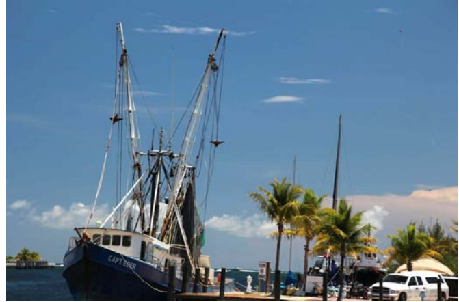
Stock Island Marina

Access to and from the Keys is primarily by U.S. Highway 1. Evacuation of the Keys' population in advance of a hurricane strike is essential for public safety. No hurricane shelters are available in the Florida Keys for Category 3-5 hurricane storm events. A system of managed growth was developed to ensure the ability to evacuate within the 24-hour evacuation clearance time as required by section 380.0552(9)(a)2., Florida Statutes. To meet a 24-hour evacuation clearance time, a phased hurricane evacuation procedure has been developed. The evacuation procedure is separated into two phases: