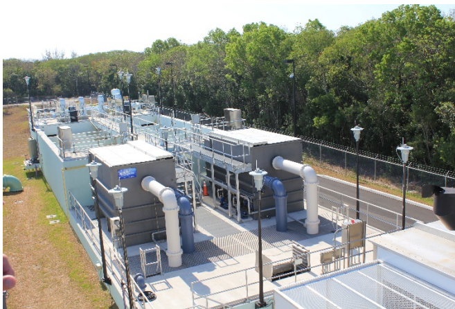
Key Largo Wastewater Treatment District Wastewater Treatment Facility

DEO recommends removing the associated sanctions contained in the rules, except those associated with continuing land acquisition efforts where a strong nexus exists.