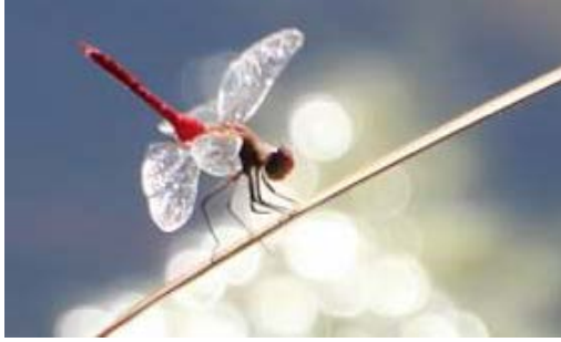
Scarlet Skimmer Dragonfly

amendments have been challenged in each jurisdiction. The three cases were combined and a hearing with the Division of Administrative Hearings is scheduled for December 2019.