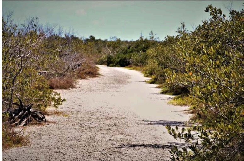
National Key Deer Refuge, Big Pine Key

This narrative provides an overview of this year's rule requirements and should be used in conjunction with the Florida Administration Commission's Matrix at Tab 3 to expedite review. The Matrix is the Florida Administration Commission Rule in a different format. It contains the status of each Work Program task in the third column as either "complete" or "incomplete" and the tasks due during this reporting period are highlighted in yellow. The Matrix includes comments and information submitted by the local governments.